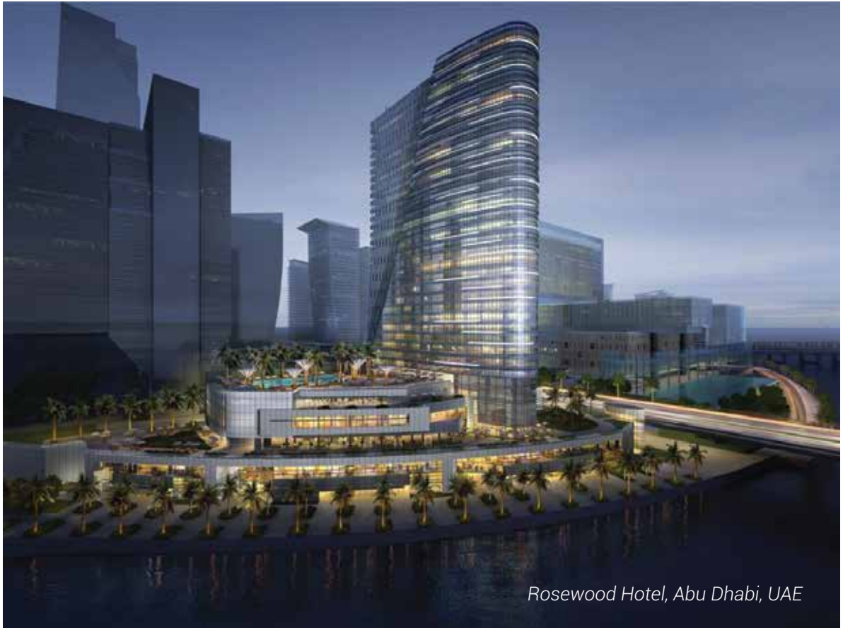
Rosewood Hotel, Abu Dhabi, UAE

11-12 October, 2019 | Rosewood Hotel, Abu Dhabi, UAE